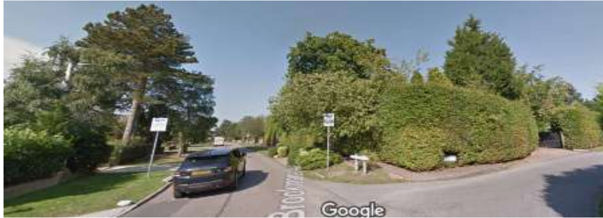
Figure 1: View towards the Brookmans Avenue site boundary

The plot is situated on the corner of Brookmans Avenue and Golf Club Road. It currently consists of a large property and outbuildings set within gardens. The site is screened by a tall beech hedge along Brookmans Avenue and part along Golf Club Road (refer to Figure 1), but then changes to a coniferous hedge in the north east corner. The site is situated on the edge of the urban environment, consisting of managed open space to the north and east in the form of Brookmans Park Golf Club and Chancellor's school playing fields. To the south and west is estate housing.