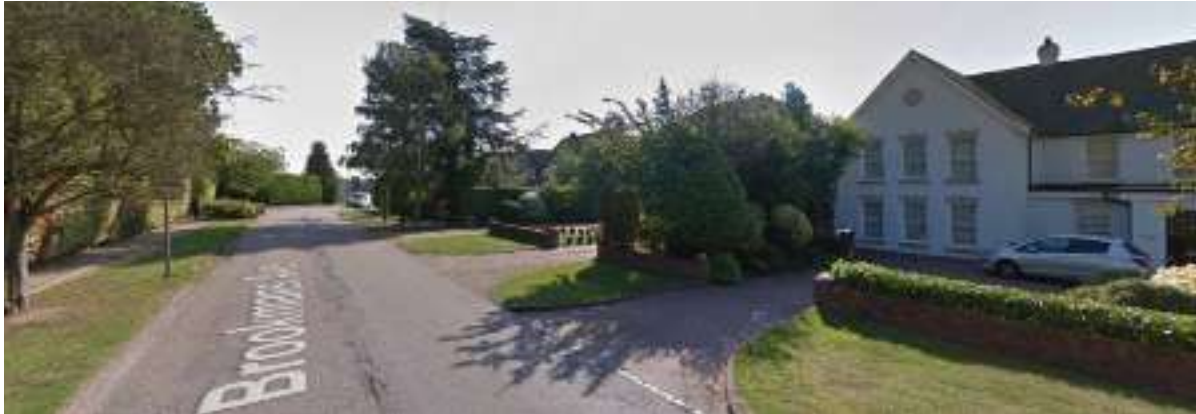
Figure 2: View along Brookmans Avenue facing east towards the site

The scheme comprises the demolition of the existing buildings and erection of five new dwellings, two facing Brookmans Avenue and three facing east into Golf Club Road. The treatment of the landscaping aims to reflect the character of the surrounding streets and also maintains a simple and semi-rural appearance. The surfacing will be granite setts at the driveway entrances and then a bound gravel to provide a robust and low-key solution. This reflects the treatment of surrounding properties (refer to Figure 2). Tree planting will be provided to maintain an enclosed environment and species selected will provide year-round interest.